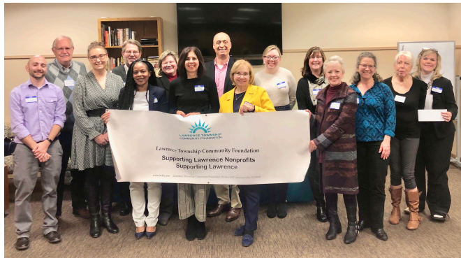
Fall 2019 Grant Recipients