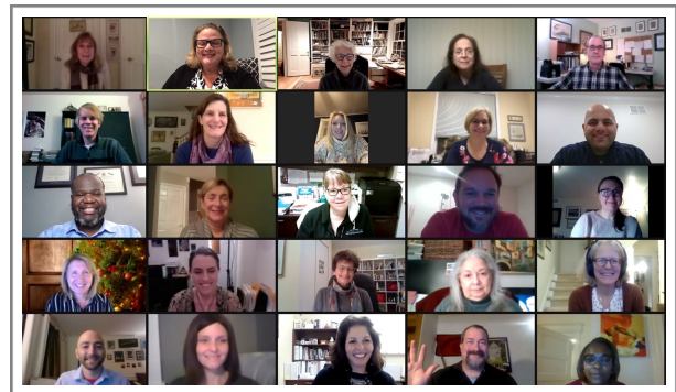
2020 LTCF Fall Grants Award Ceremony